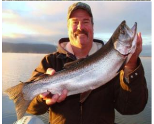
Hook & Ladder Guide Service, 28 yrs. fishing Eagle Lake

Eagle Lake Lassen County Drawn by Dewayne Hight